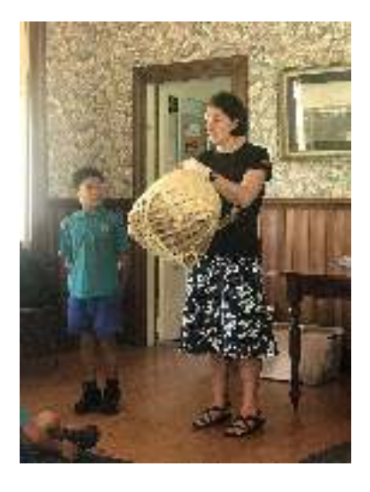
This kete is used during harvesting the kumara. It has holes in the bottom for the dirt to fall out.

We harvested kumara. We found some real big kumara.