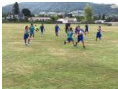
Malfroy Masters played Owhata

The senior team garden monitors began weeding the vege garden in anticipation for planting early next month. Can you spare two hours a week to help?