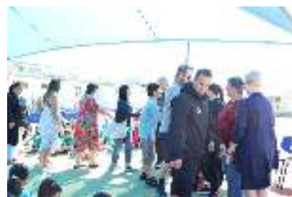
In Week 2 a special welcome (Powhiri) was held to greet new students, staff and whanau.