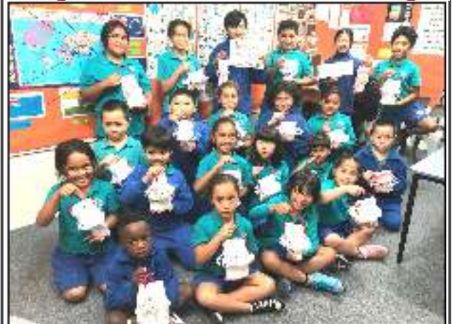
Last week the ESOL students made dragon lanterns for Chinese New Year.