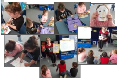
Our transition class - Some of them have already started school