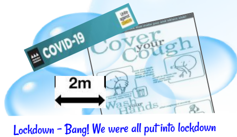
Lockdown - Bang! We were all put into lockdown

2020 is slowly coming to an end. Let's look at what we have done over this year