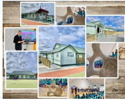
Completion of the School Hall - Our rebuilt School hall was finished, and it looks beautiful!