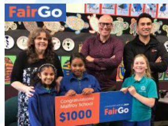
Malfroy School make it on the big screen