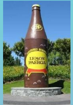
Students in Room 12 made Slandals (Slang Jandals) and we learnt about different towns in NZ