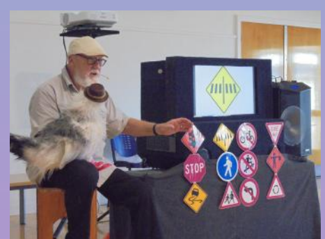
Senior School learnt how to be safe on our roads and what the road signs mean.