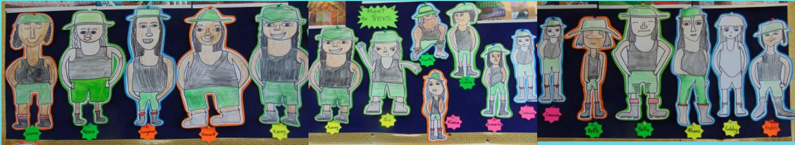
Students in Room 8 made caricatures based on the Footrot Flats and Fred Dagg cartoons