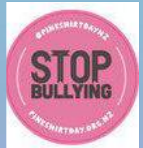
Students in Room 9 learnt what it means to be "Bully Free".