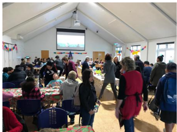
Whanau Breakfast drew in a large number of parents, grandparents and students