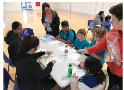
Maths Number and Problem-solving proved popular for some parents and students