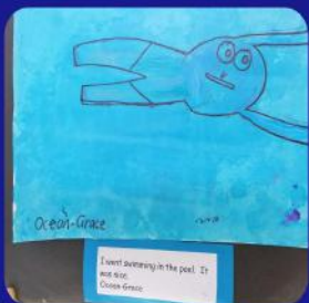
Grace I went swimming in the pool. It was so cool. Grace