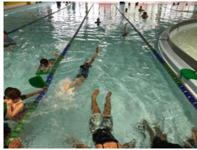
Keep your body 'stream-lined'