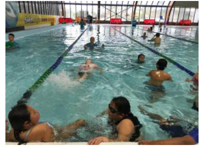
Practising kicking and arm stroke