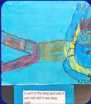
I went in the deep pool and it was cool and it was deep. Cody

In week 7 we went swimming. We had a great time and learned new skills to keep us safe around water. We followed up our swimming by writing and creating wonderful art works.