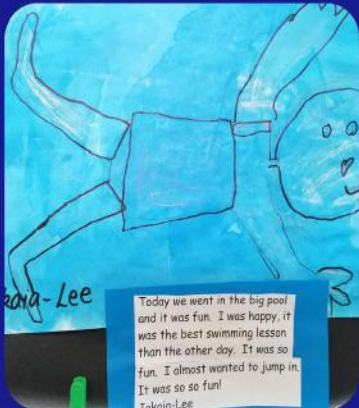
Takina-Lee Today we went in the big pool and it was fun. I was happy, it was the best swimming lesson than the other day. It was so fun. I almost wanted to jump in. It was so so fun! Takina-Lee