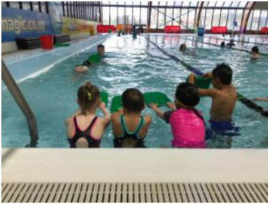
Learning to float and kick

I had the opportunity to accompany Rooms 4 and 13 on Monday. It was a great session at the pool and the swimming instructors quickly sorted children into four ability groups. The children responded really well, listening to the instructors, practising various skills such as kicking, floating, breathing, arm stroke and retrieving an object from the bottom of the pool. We really appreciate the support and time of our parent helpers.