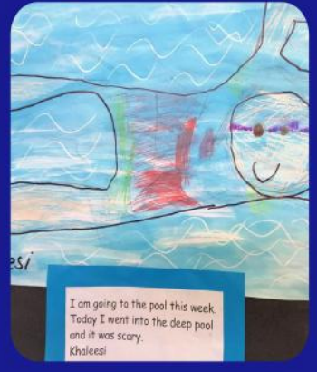
I am going to the pool this week. Today I went into the deep pool and it was scary. Khaleesi