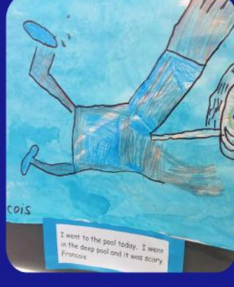
Francis I went to the pool today. I went in the deep pool and it was scary.