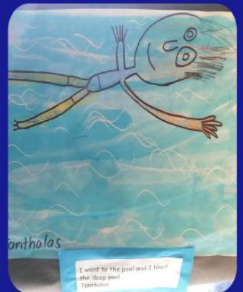
Antanas I went to the pool and I liked the deep pool. Antanas