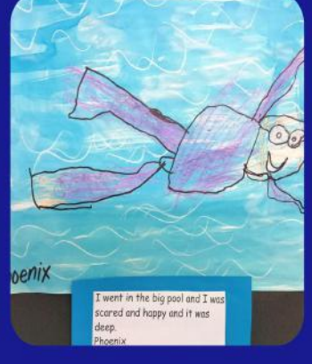
Phoenix I went in the big pool and I was scared and happy and it was deep. Phoenix