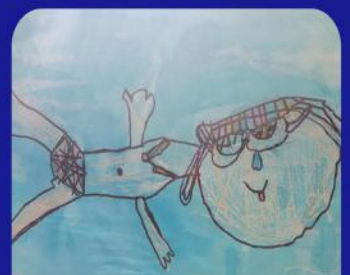
Amberley Today I went into the deep pool. It was cool and I liked it. Amberley