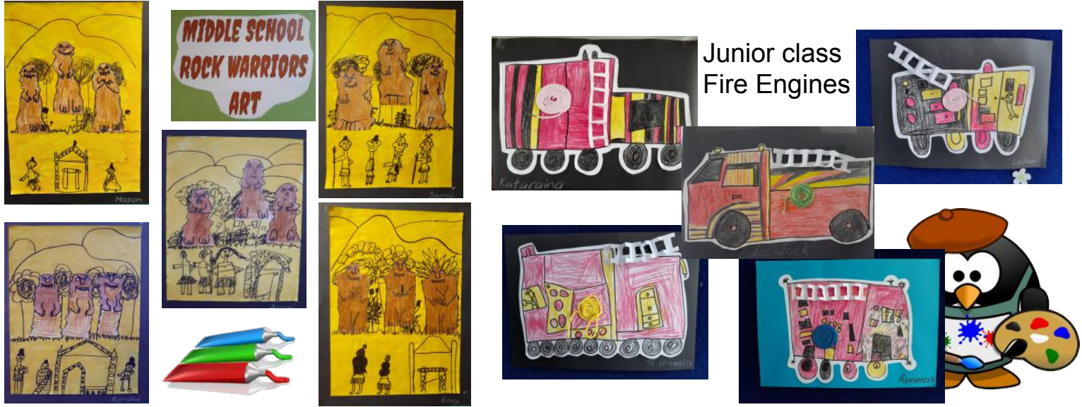
Junior class Fire Engines