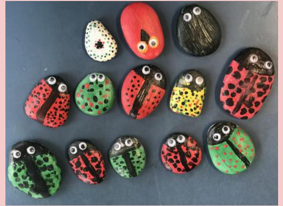
We painted river rocks as pets.