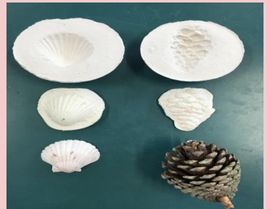
WOW! Real Fossils. We also got to make our own cast and mould Fossils.