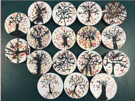
Here we have made Autumn trees on man-made rocks.