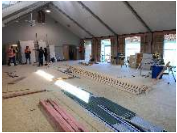
View of the front-right side out to the deck