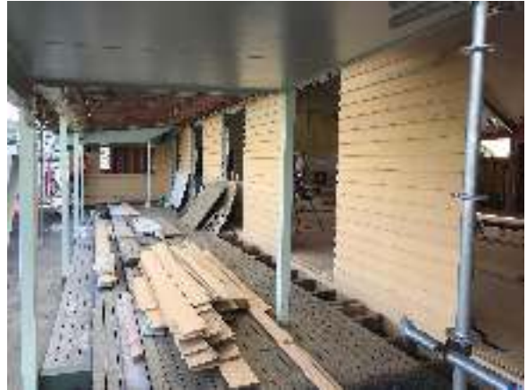
View of the deck and entrance