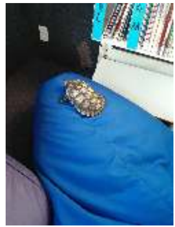
Monti enjoyed the solitude during the lockdown!