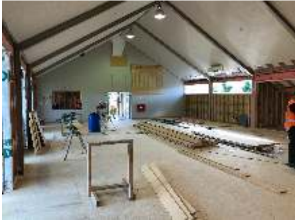
View of the back