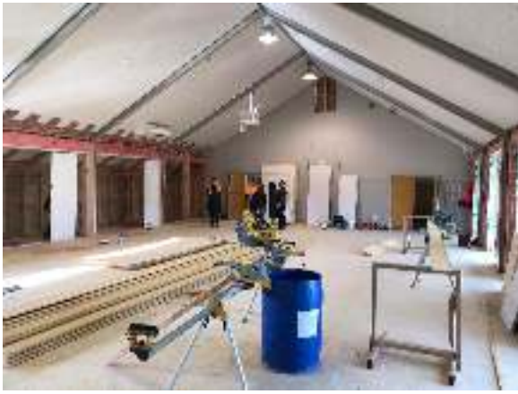
View of the front-left side