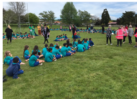
Junior classes make their way to the school fields after being given the all-clear