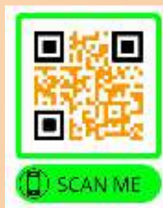
QR Code Generator