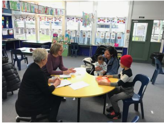
2020 Student/Parent/Teacher Conferences